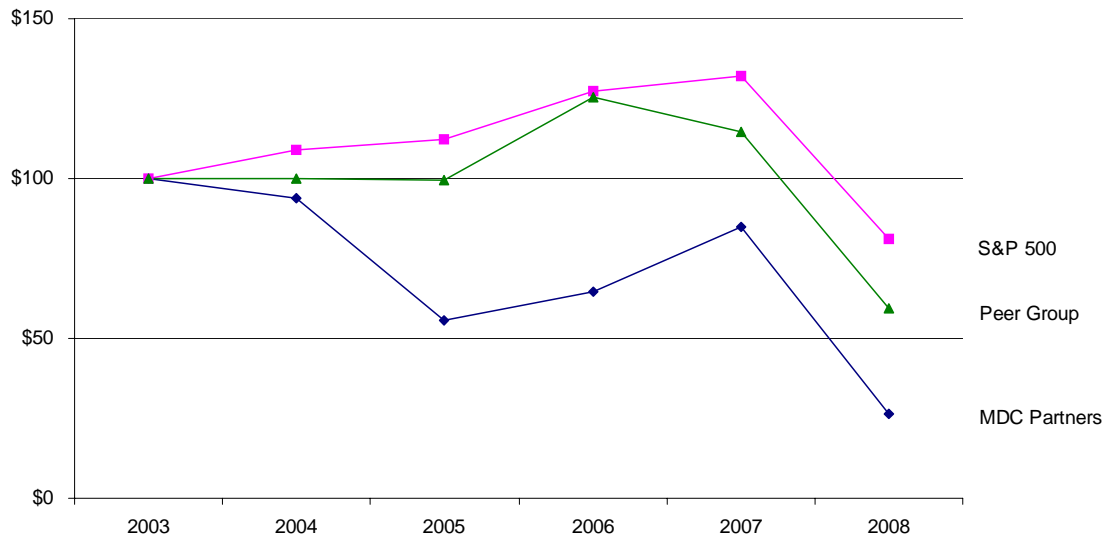
MDC Partners Inc. Comparison of 5-Year Cumulative Total Return

Set forth below is a line graph comparing the yearly percentage change in the company's cumulative total shareholder return for the last five years to that of the Standard & Poor's 500 Stock Index and a peer group of publicly held corporate communications and marketing holding companies. The peer group consists of The Interpublic Group of Companies, Inc., Omnicom Group, Inc. and WPP Group plc. The graph below shows the value at the end of each year of each $100 invested in our common stock, the S&P 500 Index and the peer group. The graph assumes the reinvestment of dividends. Total shareholder return for the peer group is weighted according to market capitalization at the beginning of each annual period.